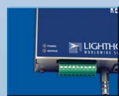
Screw Terminal Connector