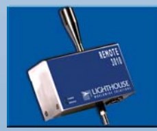
Stainless Steel Enclosure