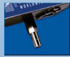
Barbed Vacuum Connector