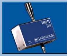
Stainless Steel Enclosure