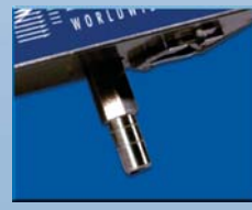
Barbed Vacuum Connector