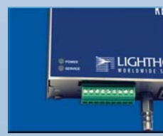
Screw Terminal Connector